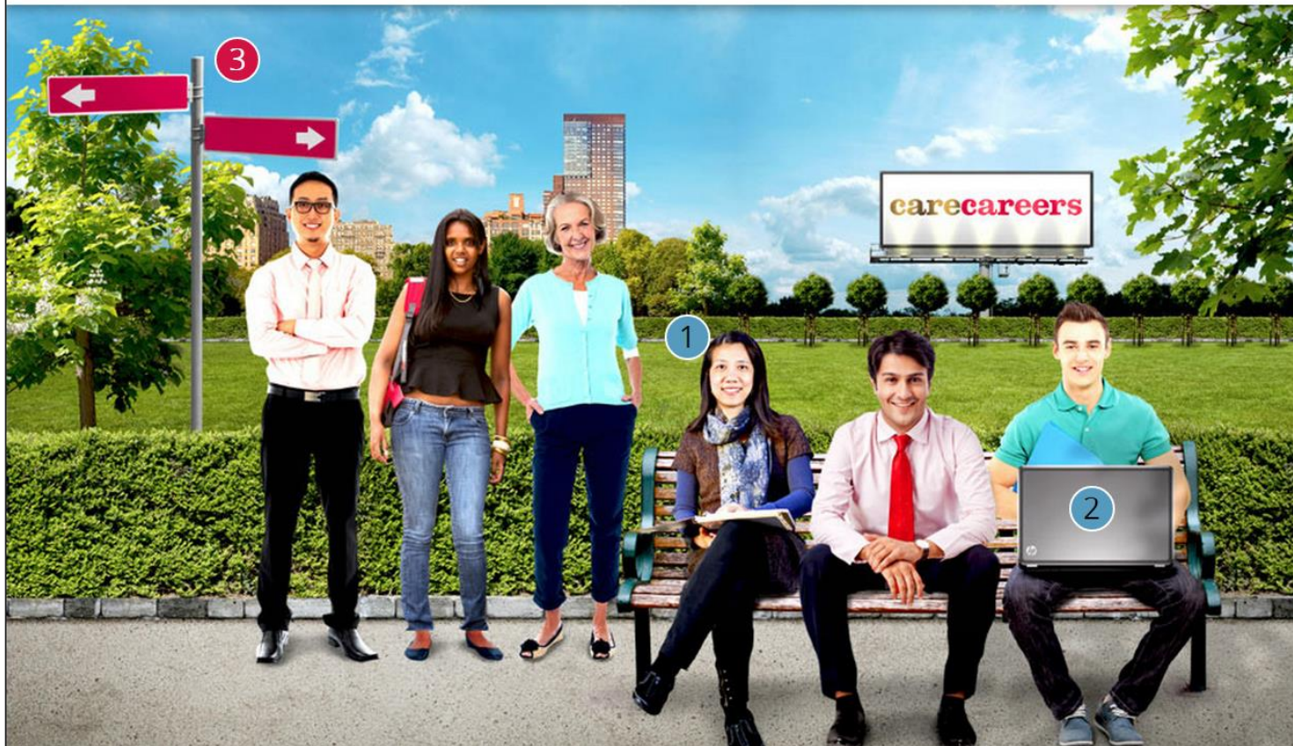
Step 7: Sample module course page with buttons to access each topic